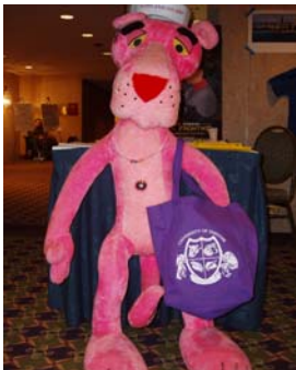
The Pink Panther loves his UFAN bag at Boskone! (Boston, February 2005)

Come see us next at Archon and Windycon!